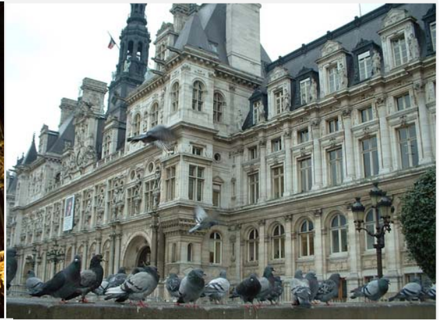
7) Hotel de Ville (city hall)