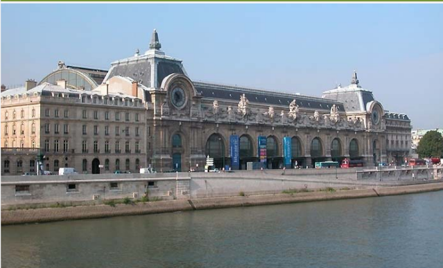
5) Cite Island with the Palace of Justice