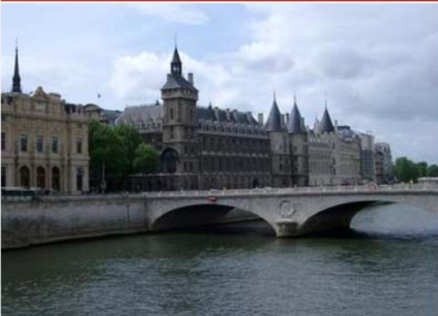
3) Seine river and its bridges

What to wear?: sport clothes & comfortable shoes