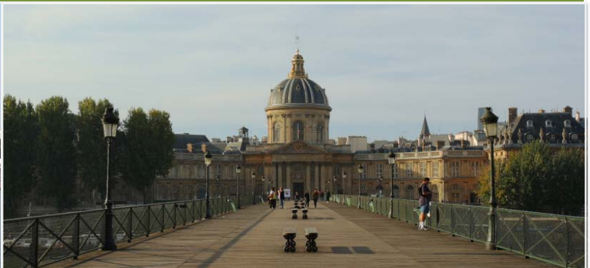
4) French Academy