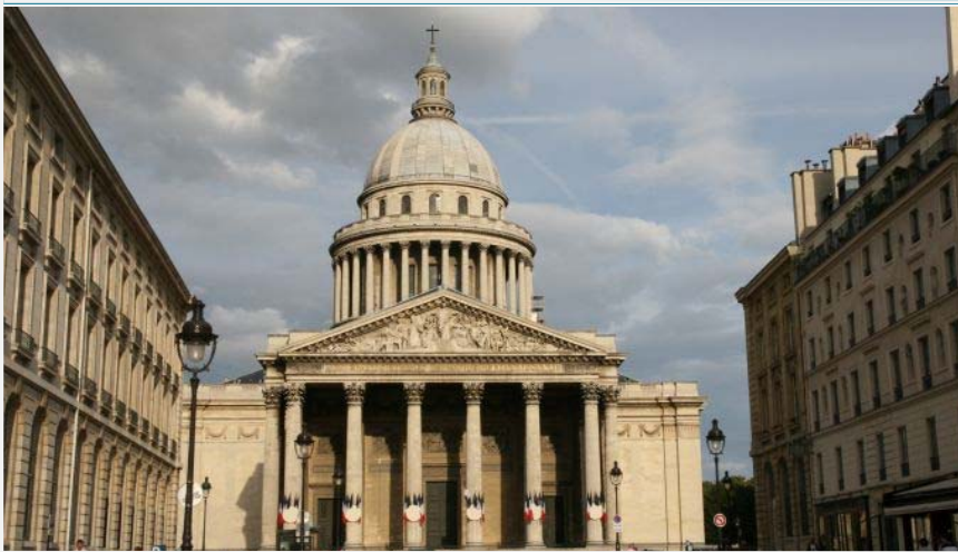
8) Latin Quarter with the Sorbonne and the Pantheon