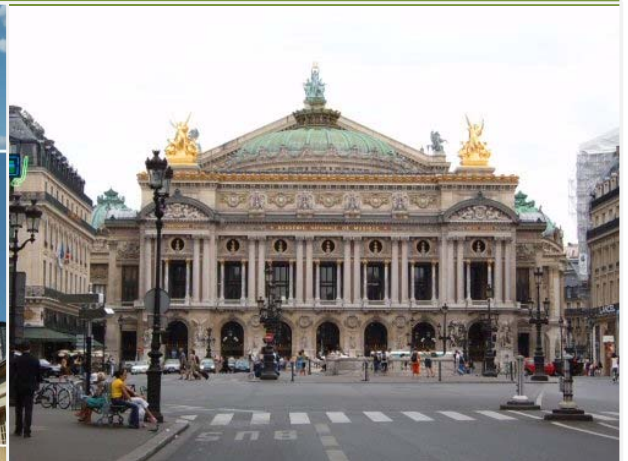
12) Opéra house ( with stop)

+ Sacre Coeur Basilica and the artists square, Place du Tertre