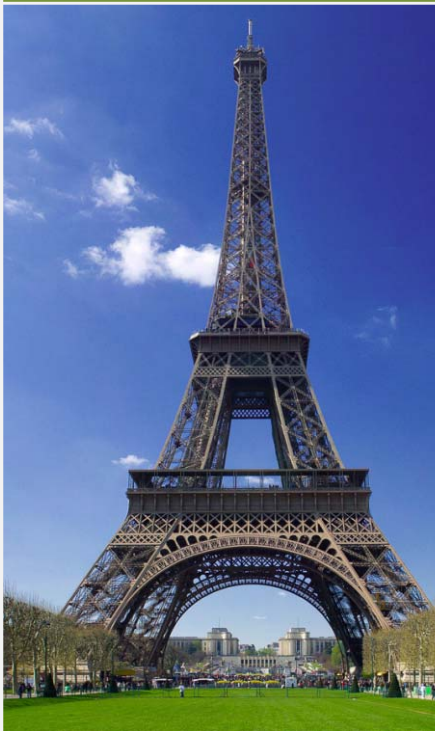
10) Eiffel Tower ( with stop)