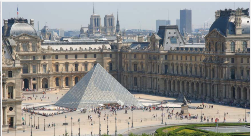
2) Louvre Museum