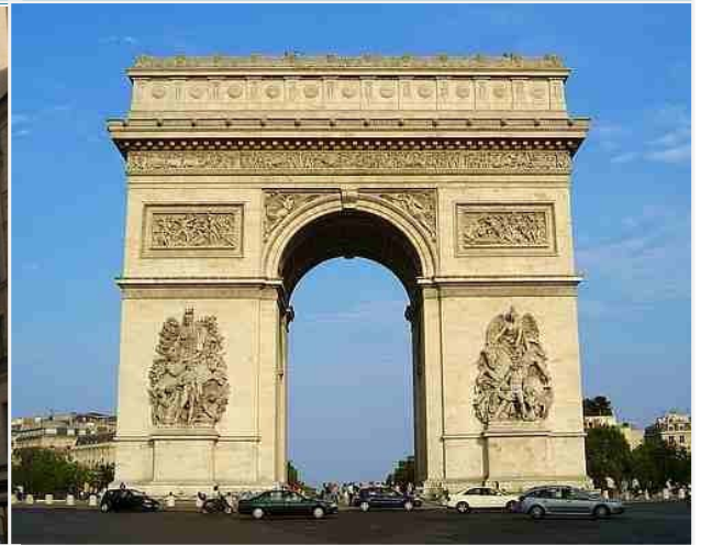
9) Arch of Triumph - Champs Elysées