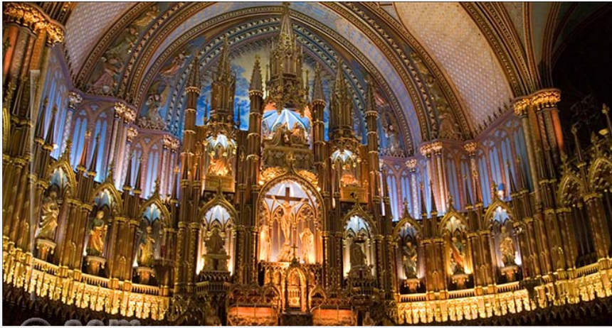
6) Notre Dame Cathedral ( with stop)