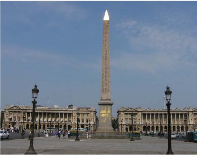
1) Concorde Square

This tour is complimentary (free) for participants with 'early bird registration payment'